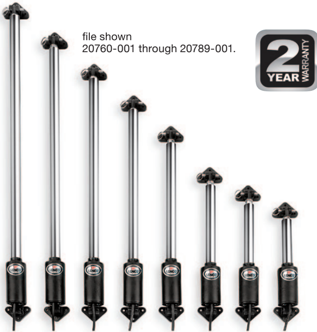
file shown 20760-001 through 20789-001.